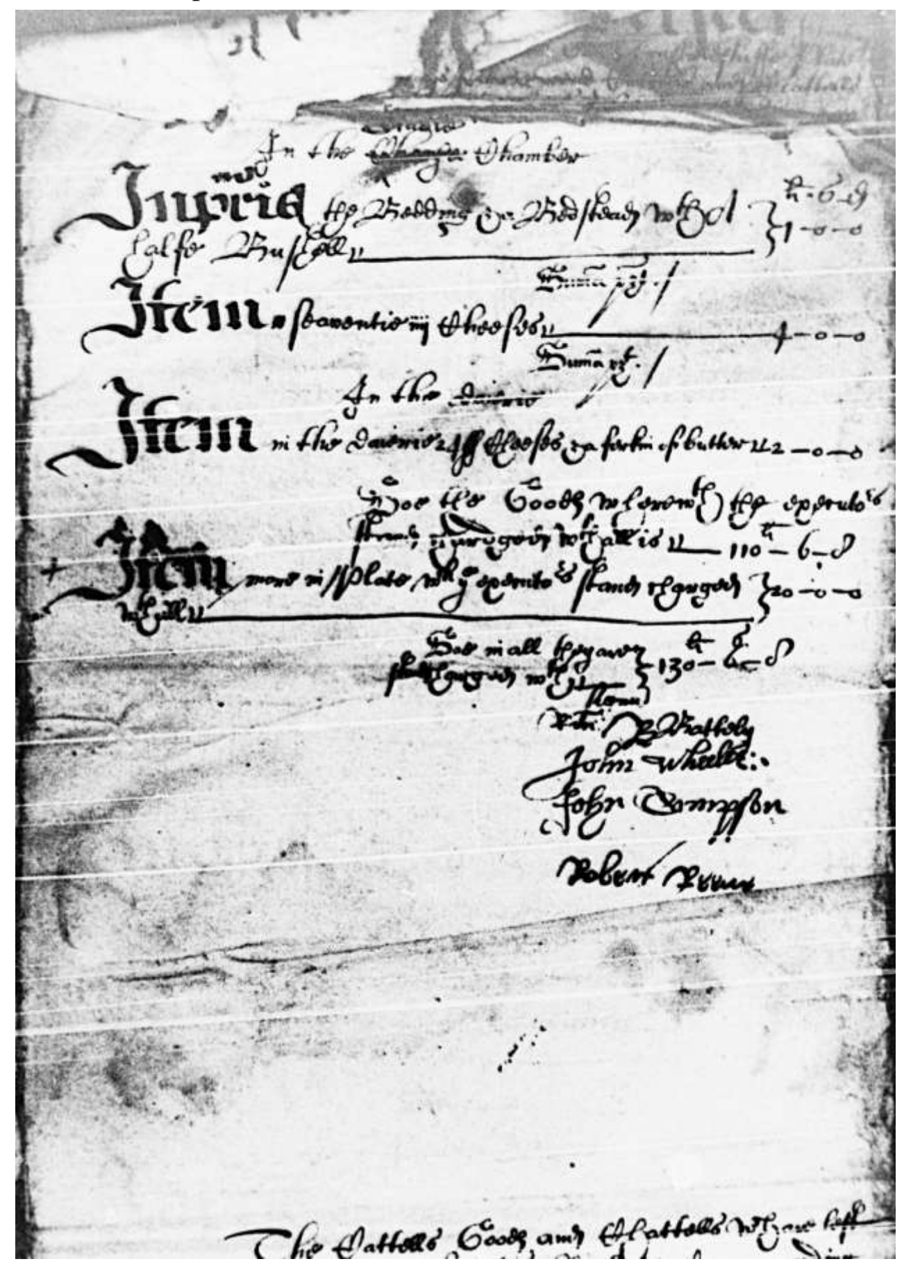
Isaak Cooper St. Lawrence Ilketshall 1639 DN/INV46/146 (3)