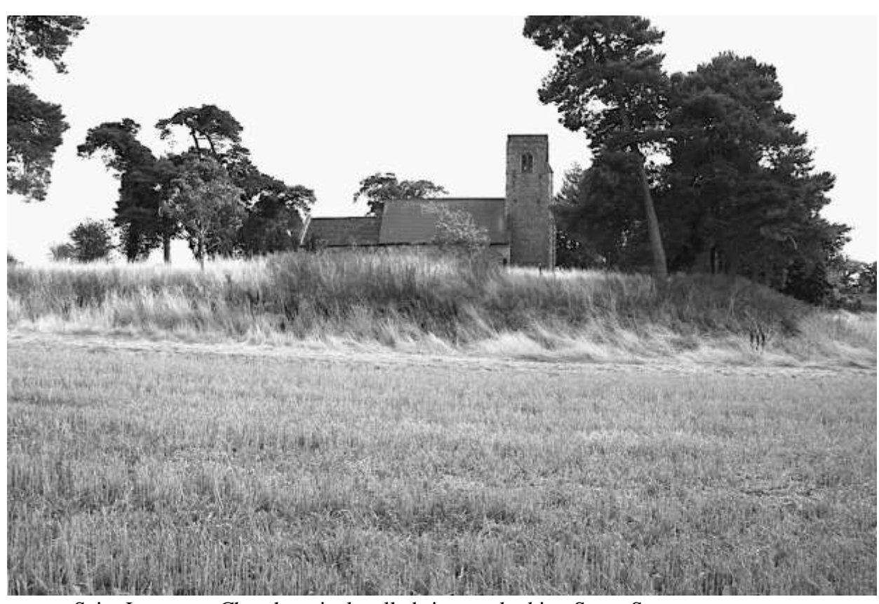
Saint Lawrence Church on its levelled site overlooking Stone Street