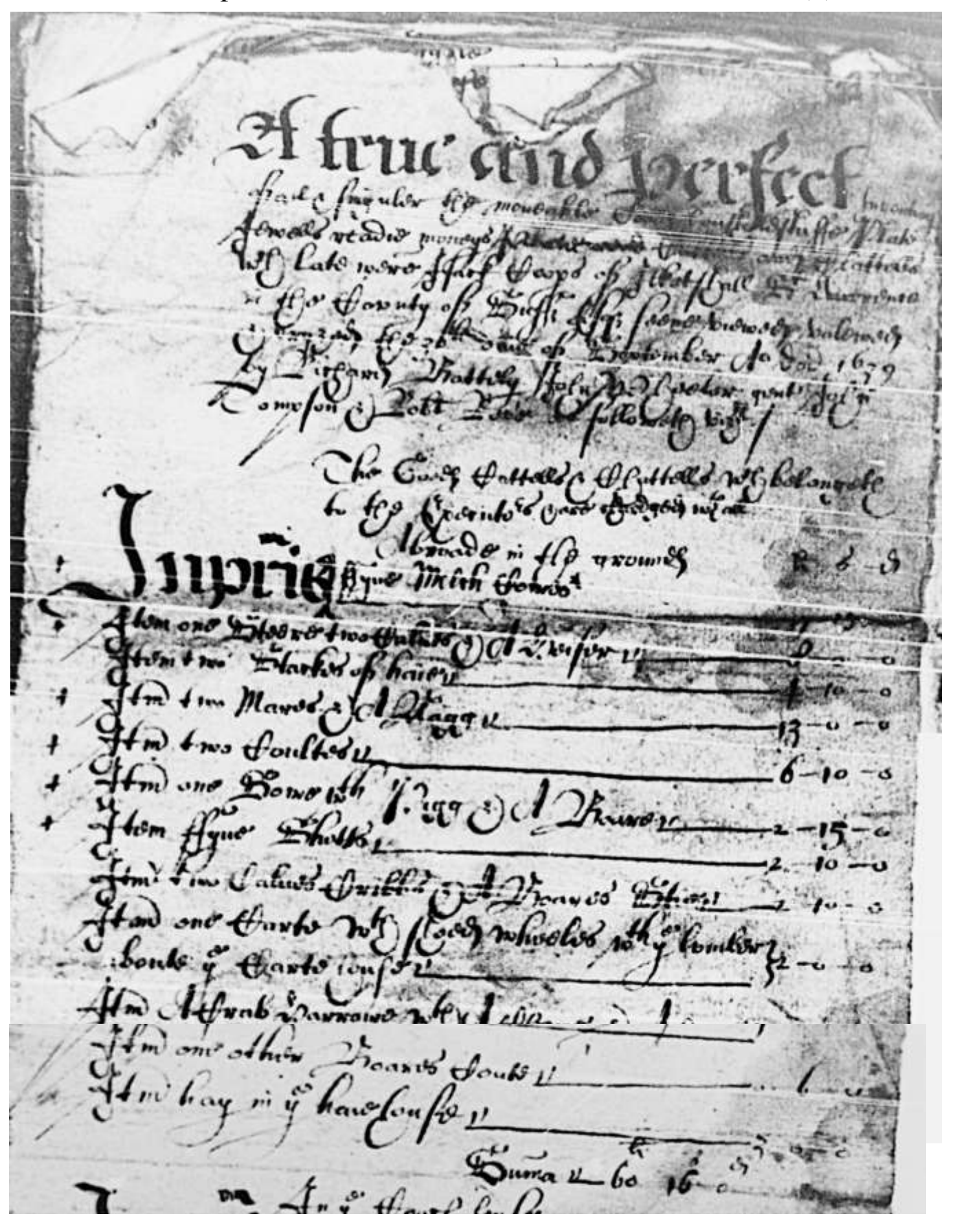
Isaak Cooper St. Lawrence Ilketshall 1639 DN/INV46/146 (1)